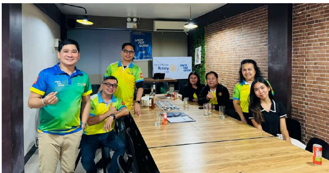
14th Regular Club Meeting