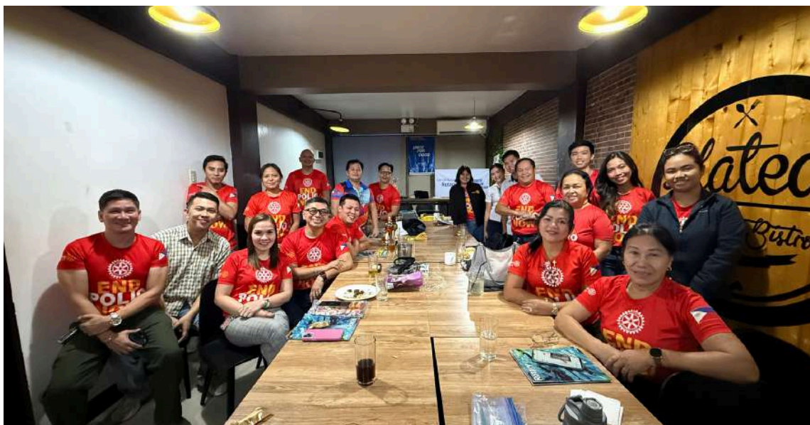
13th Regular Club Meeting